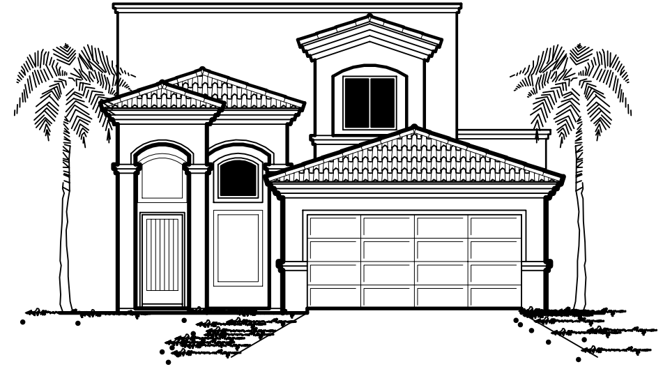
FRONT ELEVATION LIVING AREA: 1650 S.F.