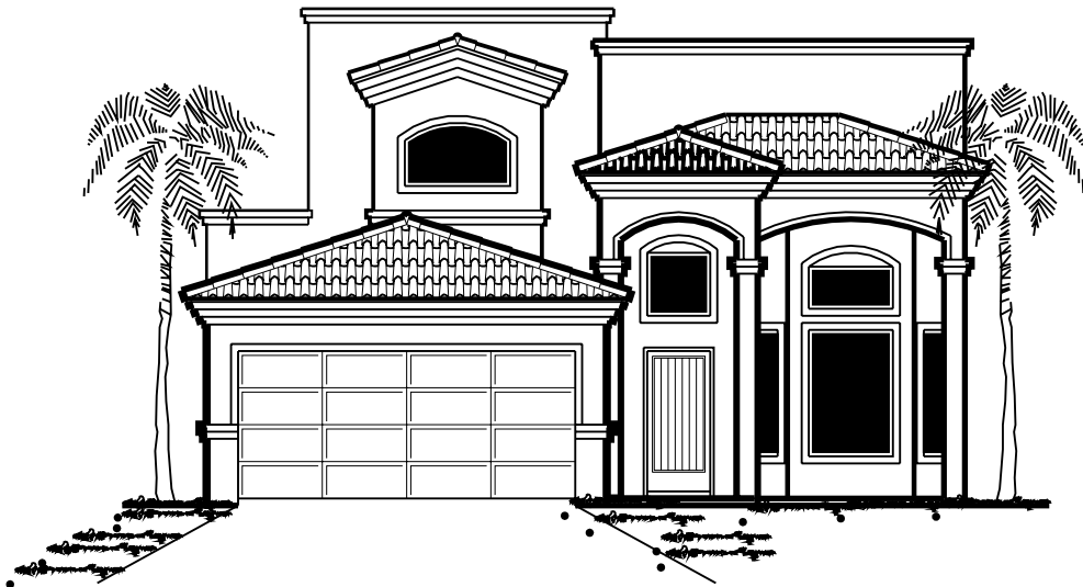
FRONT ELEVATION LIVING AREA: 1700 S.F.